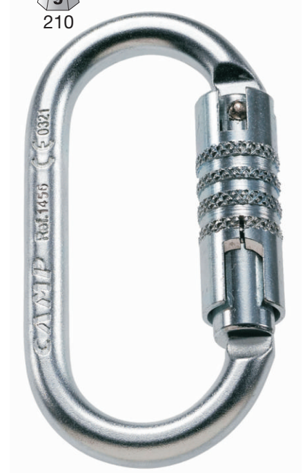
Automatic lock requires three actions: slide, twist and open.