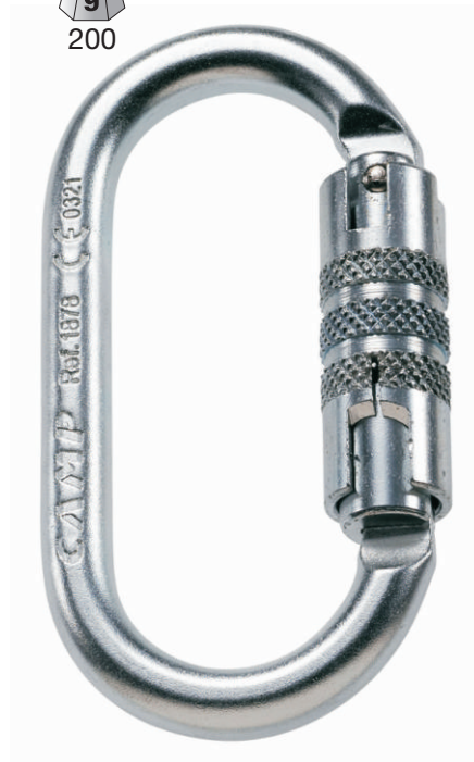
Automatic lock requires two actions: twist and open.